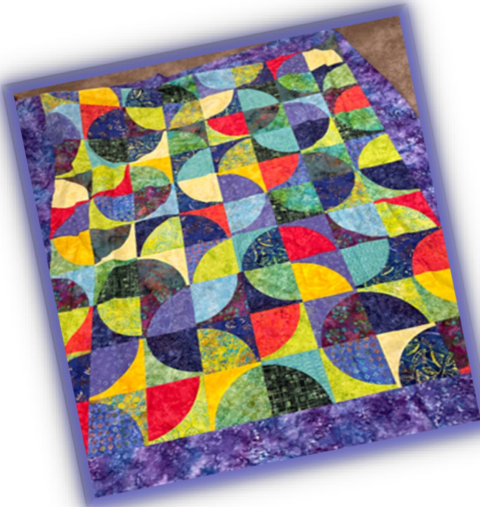
ECLIPSE "our modern" Opportunity Quilt

Remember tickets are only: $1.00 for 1 ticket or $5.00 for 5 tickets (remember our money helps our guild grow, in so many ways).