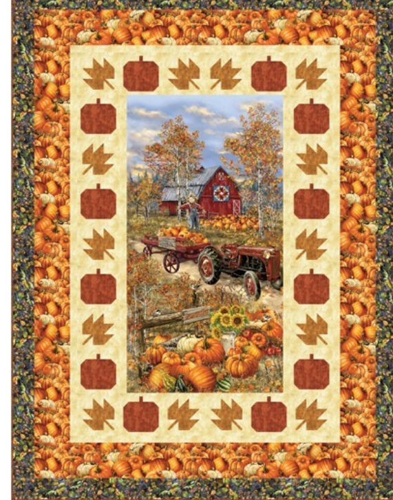
Click on Picture to go to Annie's catalog to order this kit